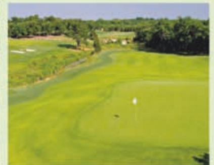
TPC Craig Ranch