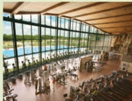
Cooper Fitness Center & Spa