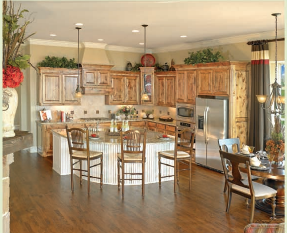
K. Hovnanian model home kitchen in The Villas at Craig Ranch

$250s - $2 Million+ Information Center: 972.529.5700 CraigRanchTexas.com/SCN