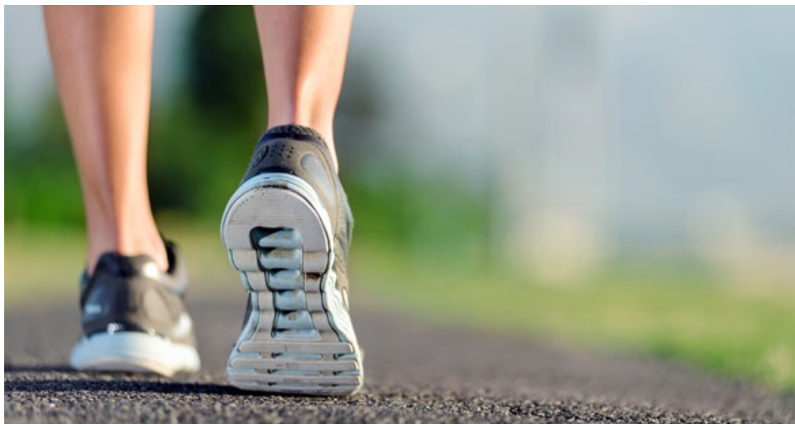
At Craig Ranch, residents have access to miles of hike and bike trails, making it easy to find fitness options.

Developers in Frisco, Plano and McKinney have found that people moving to the area want more than a home, they want a lifestyle. And the communities they build reflect that.